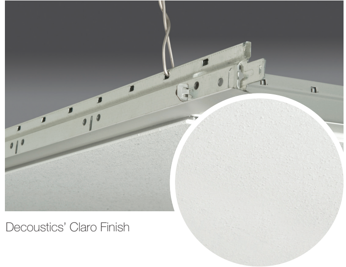
Decoustics' Claro Finish

4'x4' (1219mm x 1219mm), 2'x6' (610mm x 1829mm) and 2'x8' (610mm x 2438mm)