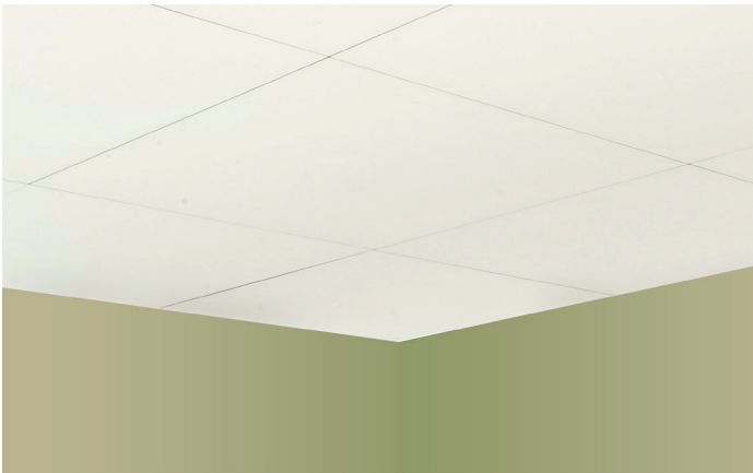
Concealed grid with 3/16" reveal